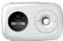
available in white only

* Taxes not included. Free shipping. Order before December 31 st , 2007.